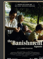
THE BANISHMENT 2007