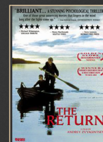
THE RETURN 2003