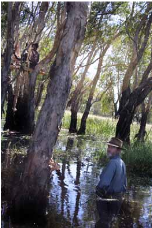
Rolf de Heer directing in the swamp.

The swamp shoot was a long, hard haul for Yolngu actor and Balanda crew alike, much as a goose egg hunting expedition would have been. None of the cast had acted in a film before, and they were not only having to relearn old skills, such as poling a bark canoe through thick reeds without falling out, but they had to learn the new skills associated with screen acting, understand things like shooting out of sequence, storytelling that was fictional rather than based on reality, as even the most distant myth has a reality level to it for Yolngu that Balanda find difficult to understand.