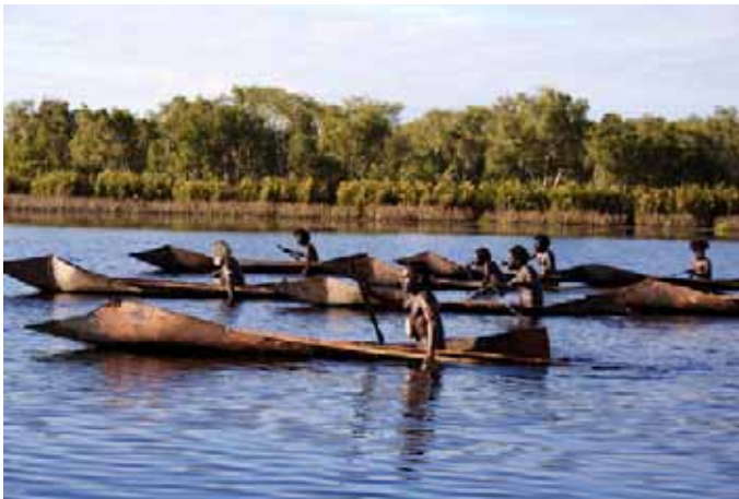
The ten canoeists on their way to gather goose eggs.

Minygululu learns that young Dayindi, on his first goose egg hunting expedition, has taken a fancy to Minygululu's third and youngest wife. Tribal law is in danger of being broken: Minygululu decides to deal with the situation by telling Dayindi an ancestral story, a story that will take a very long time to tell, all through the next days of canoe making and swamp travelling and goose egg gathering. And this is that story: