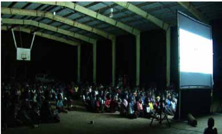
The first public screening of Ten Canoes at Ramingining, December 2005.