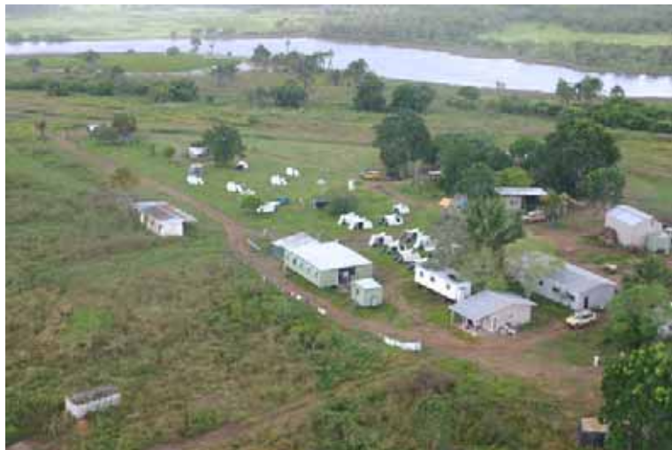
Murwangi Station and the beginning of tent city.

The camp was a living, vibrant, noisy entity. The cast generally brought wives, husbands and families and friends, and it was not long before more tents had to be shipped in to accommodate the overflow. Children played around the camp and roamed the surrounding areas, those not working would go fishing or hunting and often enough the crew and cast would return from a day's shooting to the smell of fresh fish cooking on little fires scattered throughout the camp.