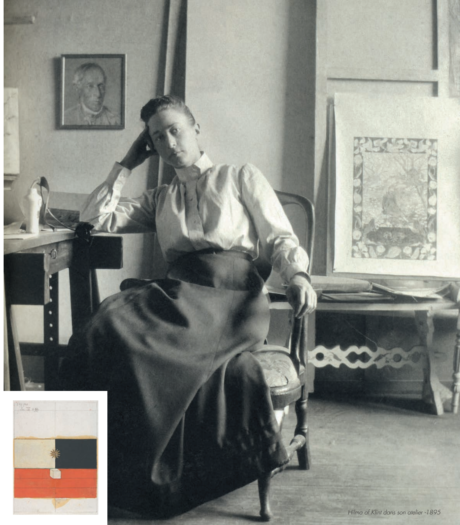
No 3b, Séries IV 1920

any sooner. This is why recognition of her work, which now forces historians to rewrite the birth of abstraction, came so late. Though her art was revealed to the public for the first time in 1986, she was only fully appreciated in 2013 after a vast retrospective was held at the Moderna Museet in Stockholm, which also toured to several other museums. Her modernity is just as relevant today and seems more at home in the 21st century. One might say that, one hundred years ago, Hilma af Klint painted for the future. ■