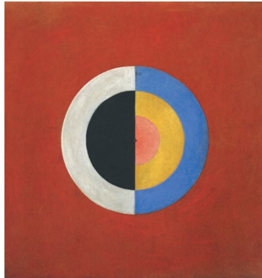
The Swan No 17-1915

H ilma af Klint (1862-1944) can be counted among the greatest artists of the 20 th century, and was a pioneer of abstract art several years before Kandinsky, Mondrian or Malevich. She was also one of the rare female artists of her generation to have as radical an approach to her creativity. As early as 1906, Hilma af Klint broke away from figurative painting after being influenced by spiritualism and theosophy. Through her art, she tried to grasp undiscovered dimensions beyond tangible reality. Along with other pioneers of abstraction, she shared a fascination for the occult and the spiritual dimensions art, all of which is manifested in her powerful and enigmatic compositions. As a medium, she was convinced her works were dictated to her from the Hereafter. "The pictures were painted directly through me without preliminary drawings and with great power. I had no idea what the pictures would depict. And, still, I worked quickly and surely without changing a single brush stroke." Despite the fact that Hilma af Klint's body of work includes over one thousand paintings and sketches, she has remained largely unknown. Because she felt they were too audacious, her abstract paintings were never exhibited during her lifetime. Klint's last will and testament imposed a twenty year waiting period after her death before they could be shown, since she was convinced they could not be understood