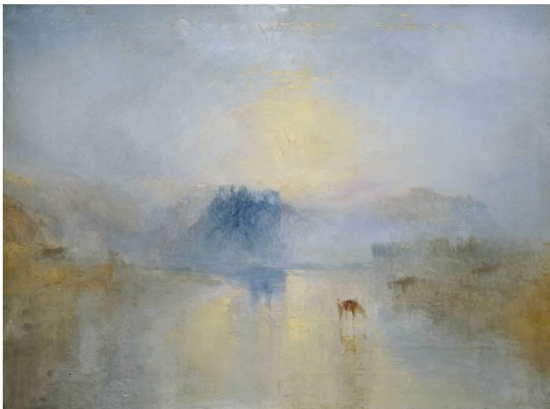
Norham Castle, Sunrise c.1845

Tate. Accepted by the nation as part of the Turner Bequest 1856