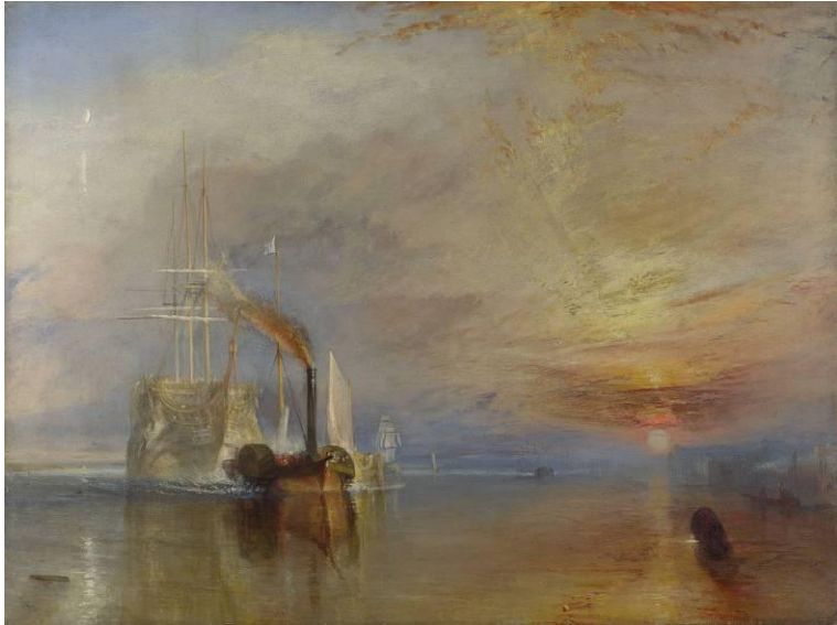
The Fighting Temeraire tugged to her last berth to be broken up, 1838

The following works are part of the National Gallery Collection and if media would like to use them for publicity purposes should contact the National Gallery Press Office on 0207 747 2865 / press@ng-london.org.uk