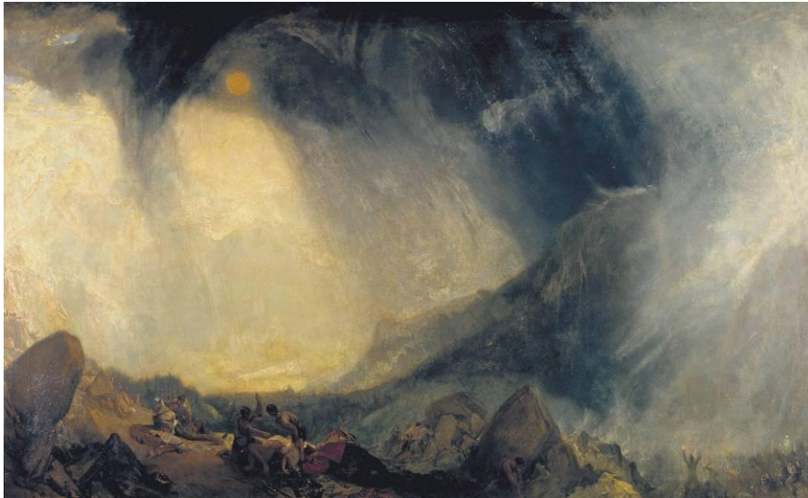
Snow Storm: Hannibal and his Army Crossing the Alps exhibited 1812