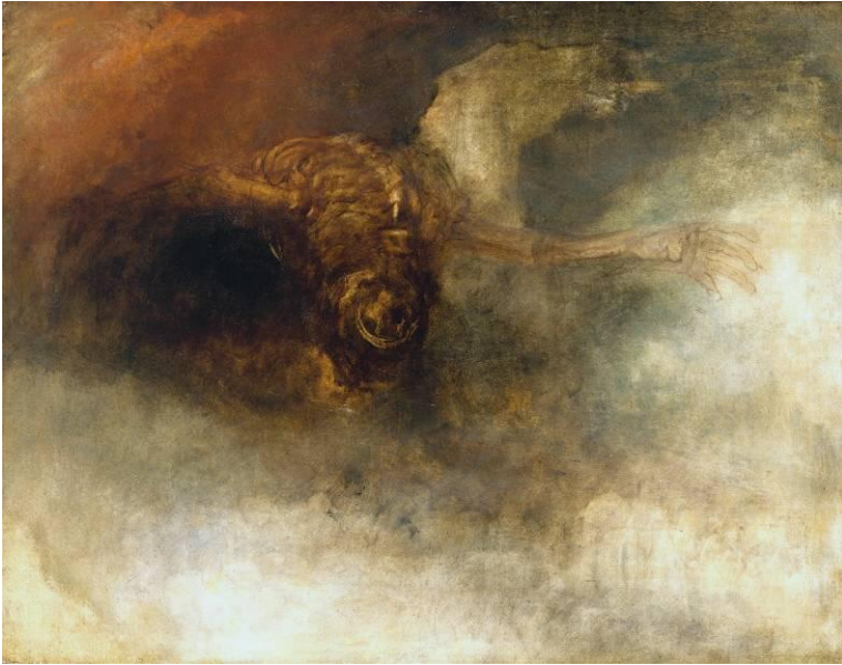
Death on a Pale Horse (?) c.1825-30