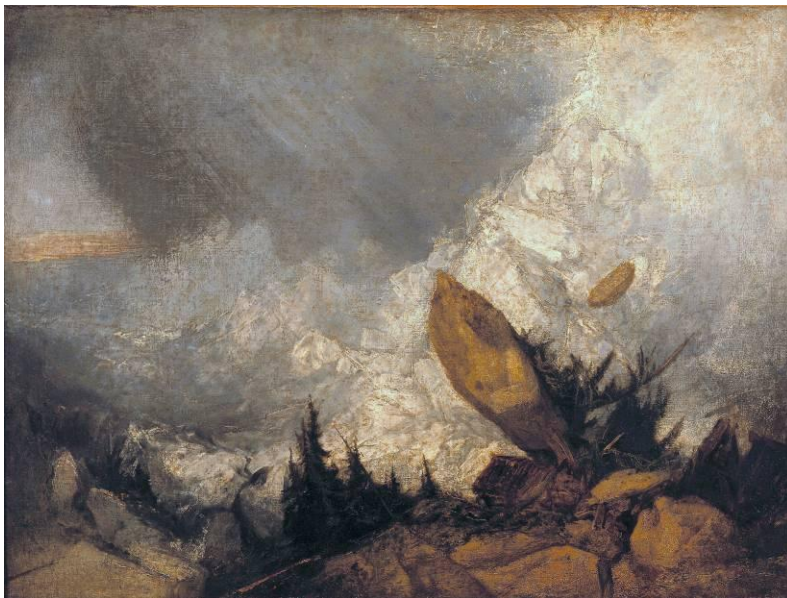
The Fall of an Avalanche in the Grisons exhibited 1810

Tate. Accepted by the nation as part of the Turner Bequest 1856