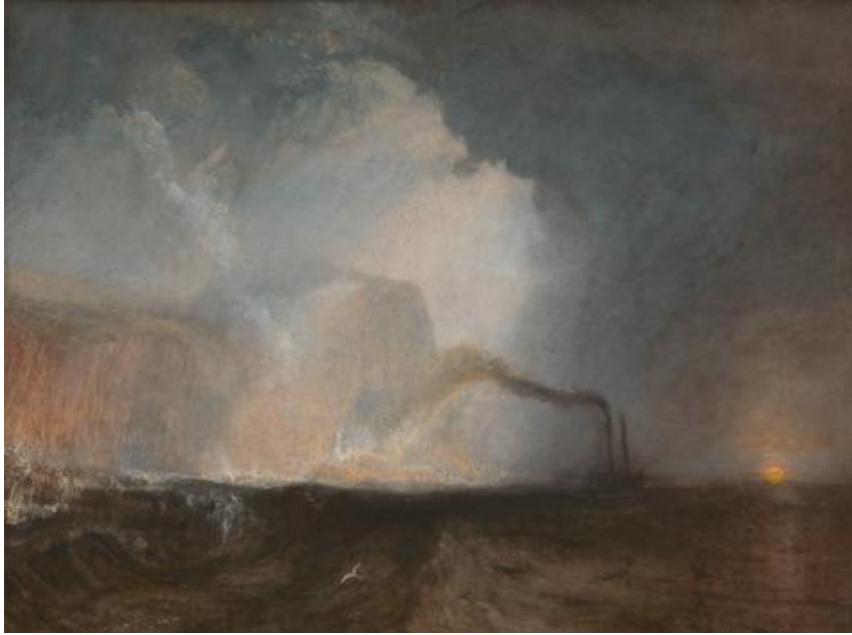
Staffa, Fingal's Cave (1831 to 1832)