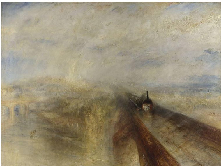
Rain, Steam, and Speed - The Great Western Railway